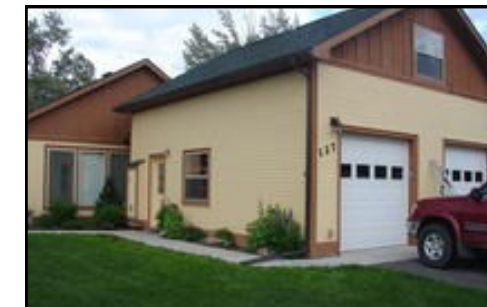
Bonus Room Above Garage